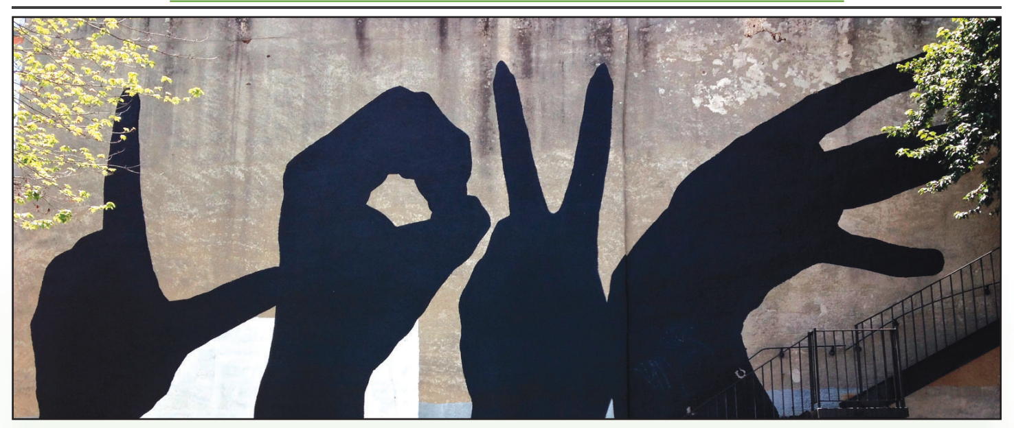
One of 20 love walls around Baltimore, Maryland, part of the Baltimore Love Project. This is in southwest Baltimore near Hollins Street Market.