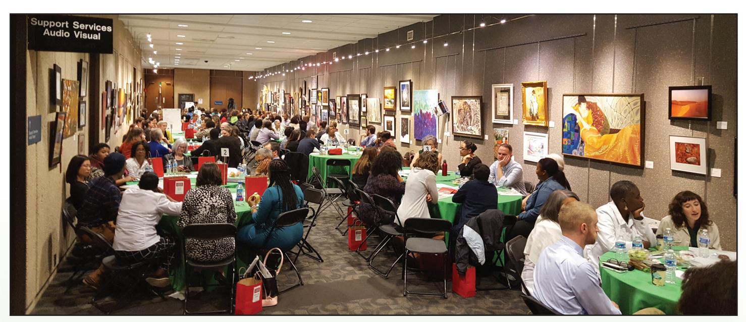
Small group discussions at the symposium.