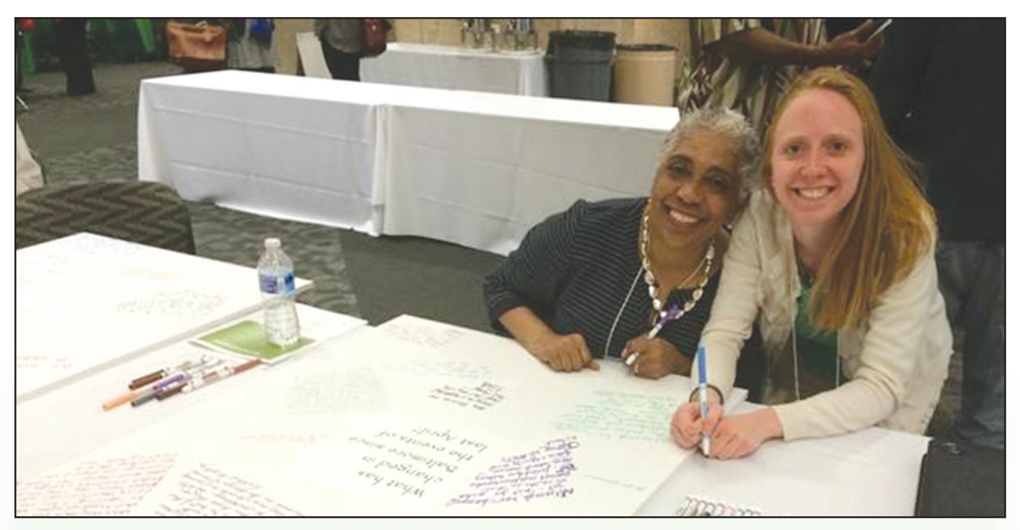
Interactive art project at the symposium.