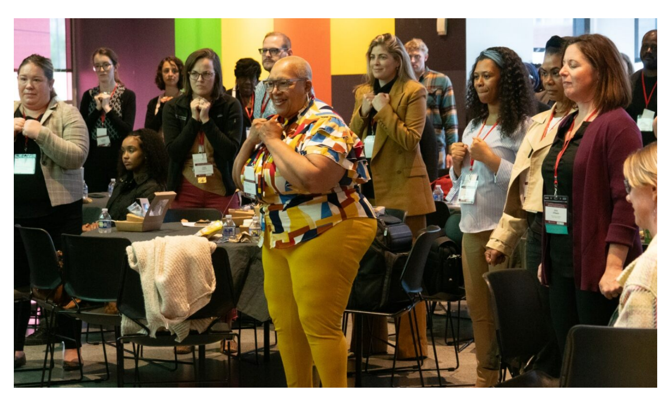
Symposiums attendees take a momen to re-energize with QiGong.